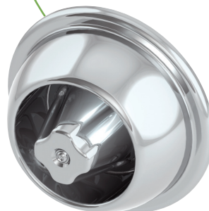
Diverter Valve Trim 57-458-TRM