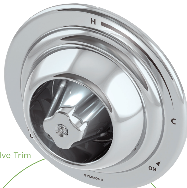
Shower Valve Trim 5700-TRM