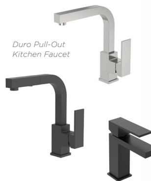
Duro Pull-Out Kitchen Faucet