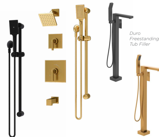
Duro Freestanding Tub Filler